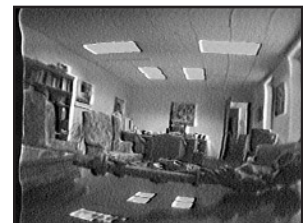
Captured Surveillance Video Printed at reduced resolution to preserve confidentiality.

This unusual aerial video surveillance was captured during an inspection of a client location. The large airplane – noncommercial, specially modified – was the specific target. This picture is included to illustrate the remarkable detection capabilities of our RRSA® system.